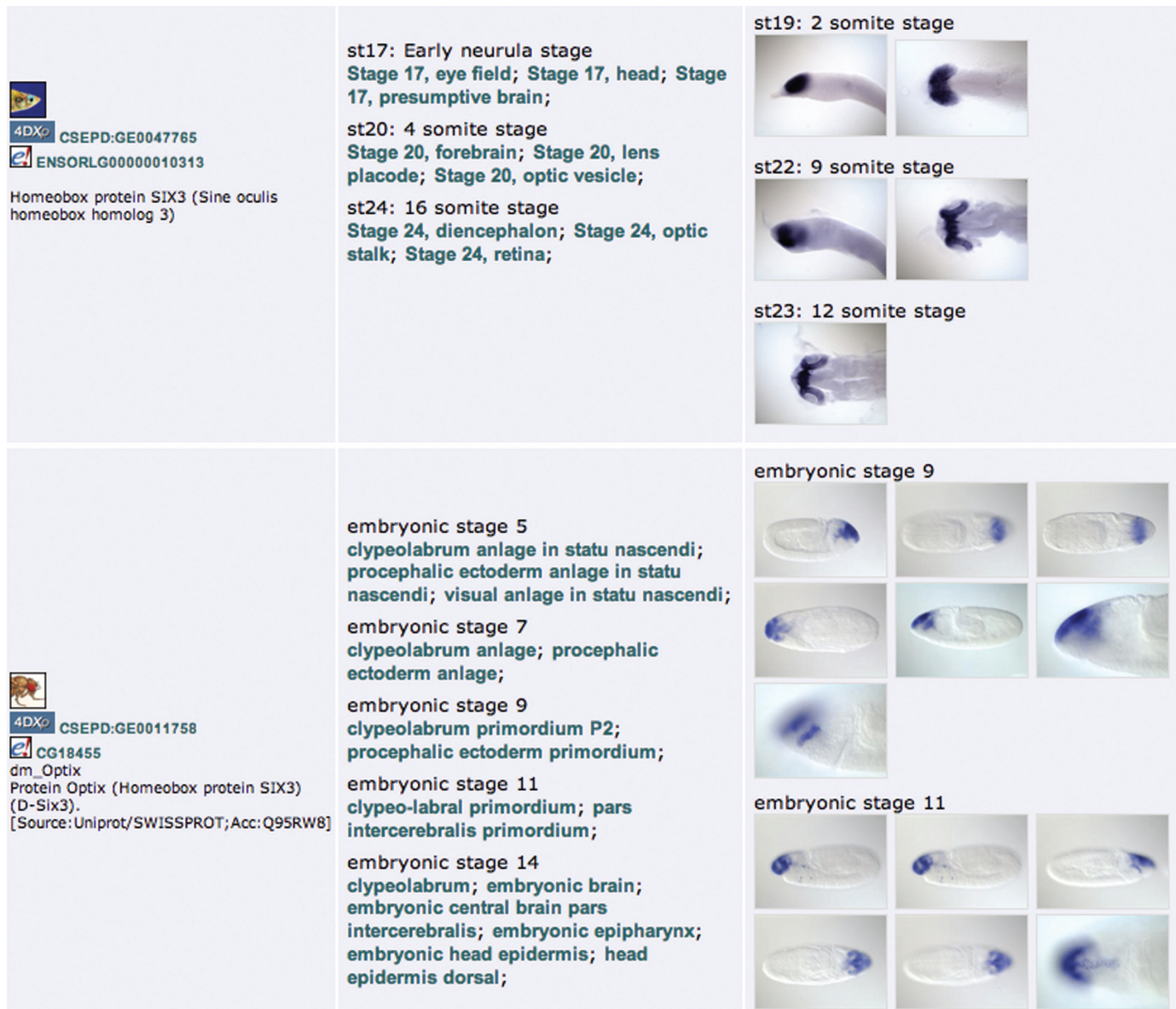
Figure 3. The comparative view shows expression patterns of a list of selected genes (medaka Six3 and its Drosophila orthologue Optix). Expression annotation and images can be easily compared between the genes on a single page.