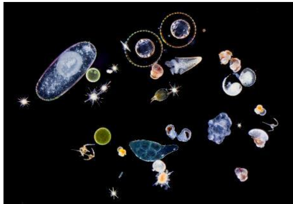
Protists and planktonic larvae