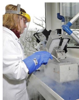
ARN extraction at Genoscope