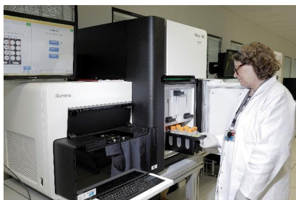
Sequencer in CEA-Genoscope

Elodie BERNOLLIN elodie@taraexpeditions.org Tel.: 06 95 73 26 88 taraexpeditions.org